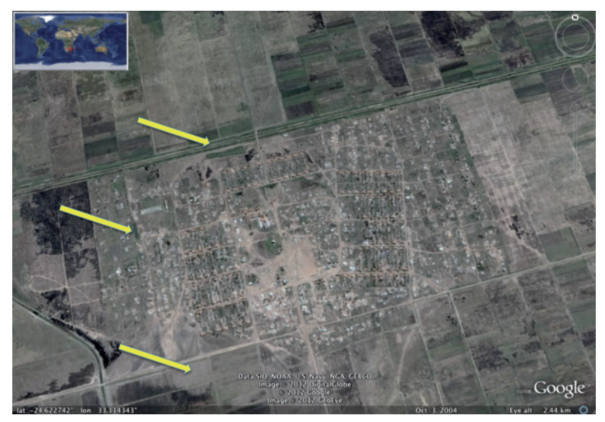
Fig. 1. Google Earth file Massavasse.kmz showing Massavasse village, Chockwe district, Gaza province, Mozambique including some of the different water bodies searched for mosquito larvae during the study.

The 1 x 2 km rectangular village of Massavasse (24° 62' S latitude; 33° 108' E longitude), is situated in the Chockwe irrigation scheme (the largest in Mozambique). On the outskirts of the village houses are generally mud walled with thatch roofs, whilst in the middle of the village, cement houses dating from colonial days, are to be found. The village, which is divided into five separate localities, has a health post where residents can receive treatment for malaria. As might be expected from an irrigation scheme, the surrounding area is flat and treeless. Rice is the primary crop grown. Two feeder canals border the northern and southern edges of the village (Figure 1, Google Earth kmz file). People buy their water for irrigation